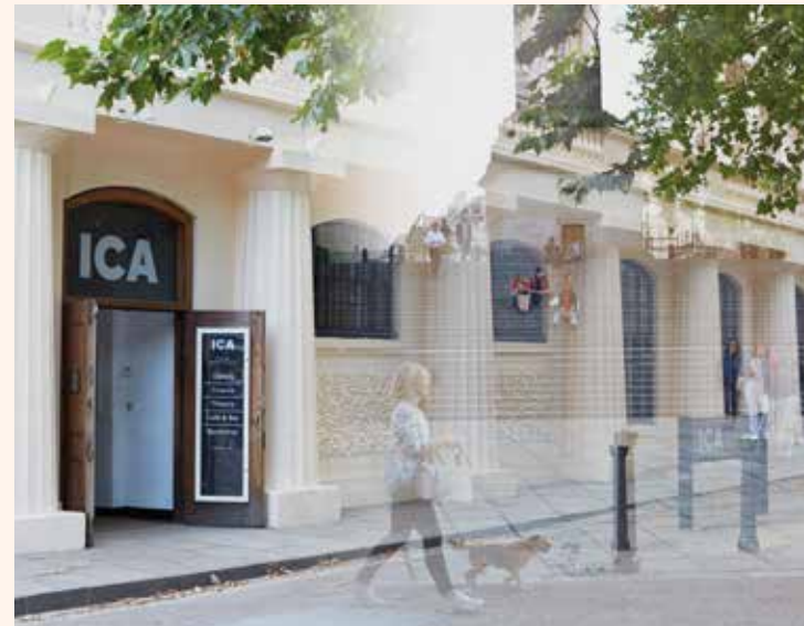
Institute of Contemporary Arts