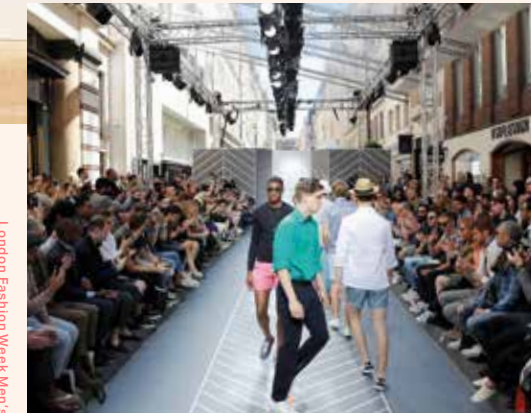
London Fashion Week Men's on Jermyn Street

St James's has character and it has colour. It has a sense of grandeur, but it's also steeped in history.