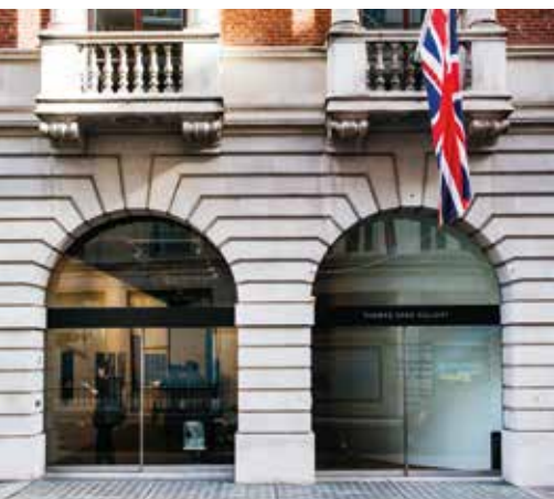
Thomas Dane Gallery